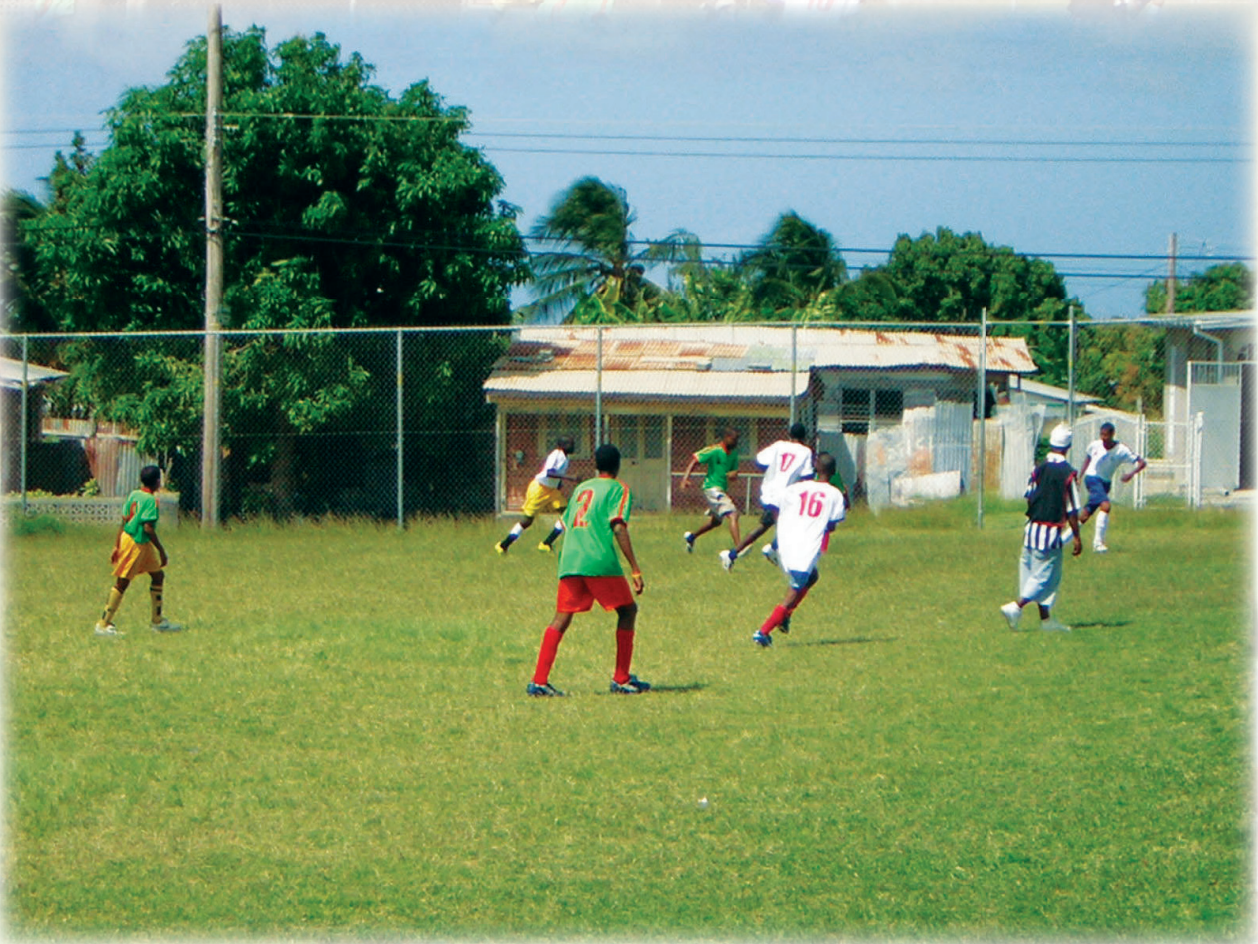
National Youth Policy youth playing football.

The fiscal constraints under which the Government is operating have led to the introduction of more stringent measures to justify all expenditure. However, the costs of implementing the National Youth Policy can be justified in terms of investment in the future of Barbados. The World Bank Report on youth development in the Caribbean, as shown above, has drawn attention to the cost to the nation when young people fall victims to the threats of delinquency, teenage pregnancy, criminal activities, and early death from violence, Chronic Non-Communicable Diseases and HIV/AIDS. In Barbados, a useful comparative cost is the $12,000 it takes per year to maintain a young person under 18 years at the Government Industrial School and the considerably higher cost of incarcerating young people in Her Majesty's Prison.