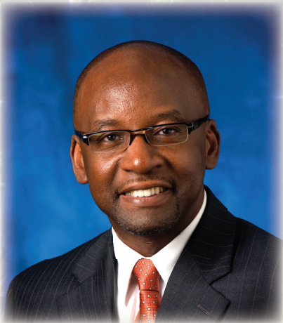
Hon. Stephen Lashley Minister of Family, Culture, Sports and Youth

When the first draft of the National Youth Policy was completed, 4 Town Hall meetings were held – at the Solidarity House, Barbados Workers’ Union (20 th November 2010), at the Steel Shed (13 th May 2011), at the Hilda Skeene Primary School in St. Philip (14 th May 2011) and at Alexandra School (17 th August 2011) - to allow the public to discuss the proposed policy. After each gathering the document was revised.