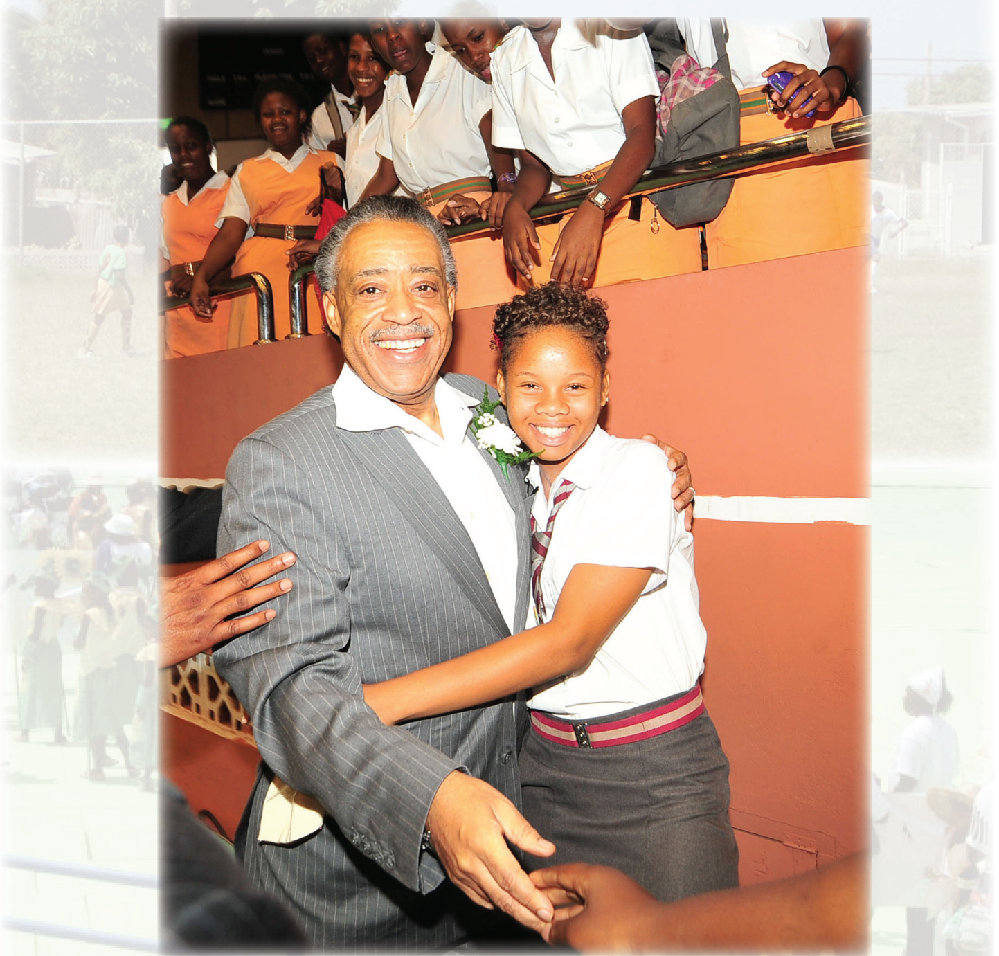
Rev. Al Sharpton at the Sir Garfield Sobers Gymnasium with a student from Coleridge & Parry Secondary School.

No doubt these mechanisms for implementing the