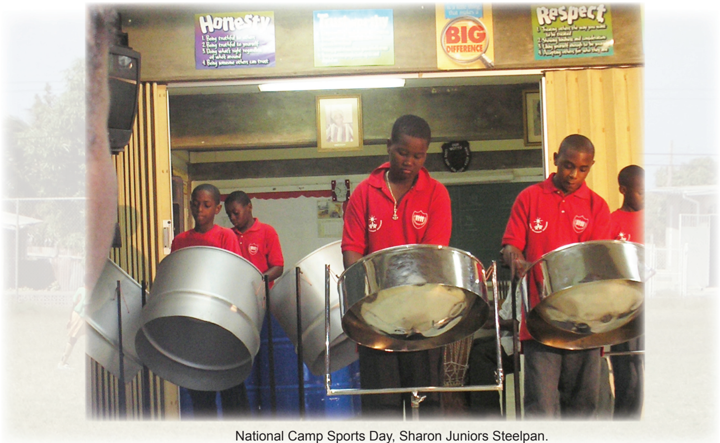
National Camp Sports Day, Sharon Juniors Steelpan.