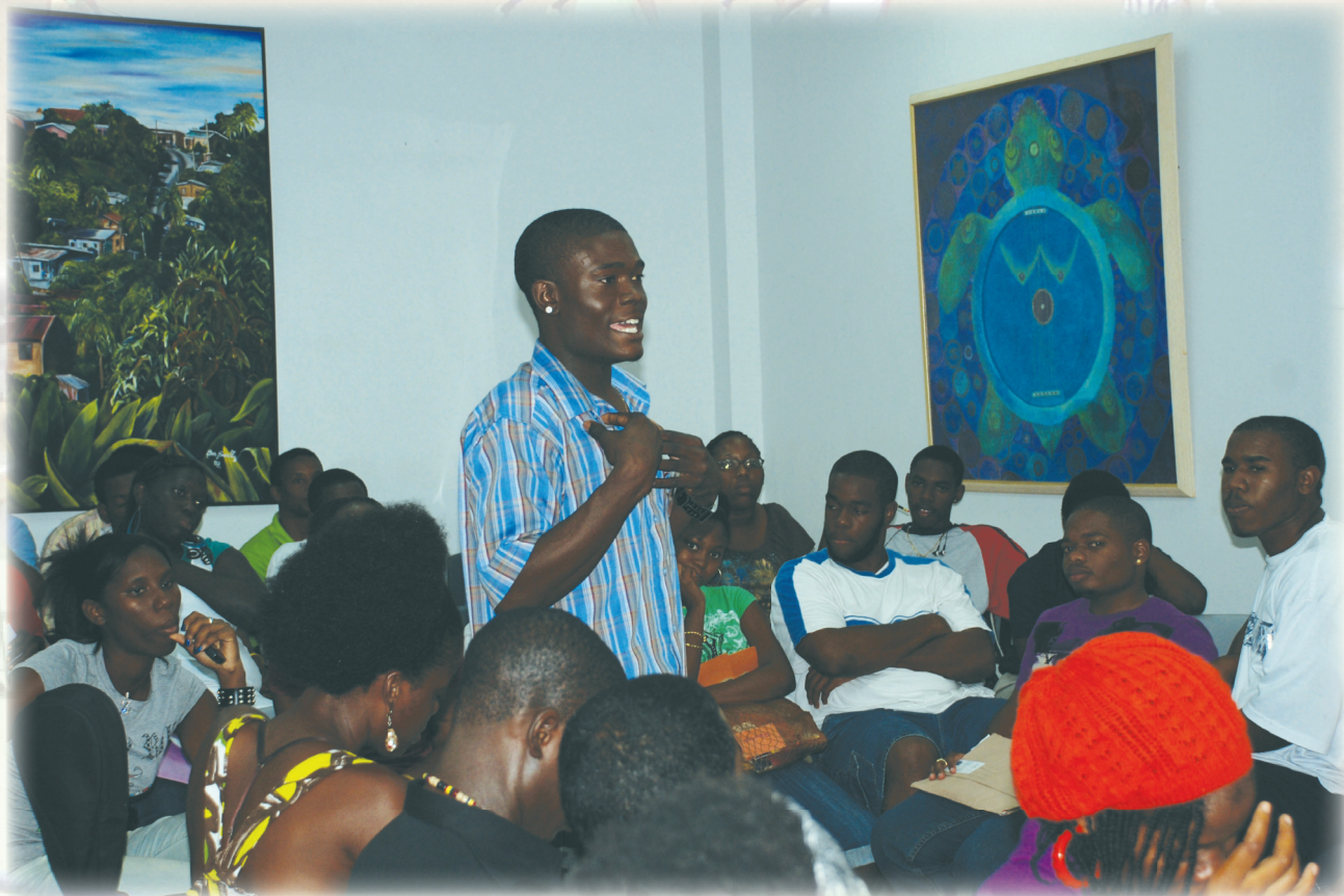
Youth expressing himself in open youth forum.

clearest possible indication that the child has successfully made the transition to adulthood. They have to take a measure of responsibility for their own personal development. This in effect is the clearest possible indication that the child has successfully made the transition to adulthood.