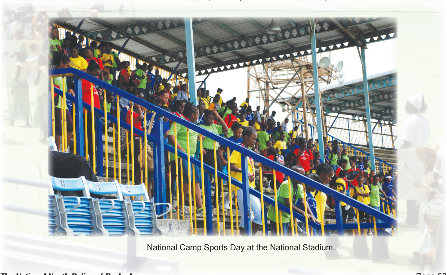
National Camp Sports Day at the National Stadium.